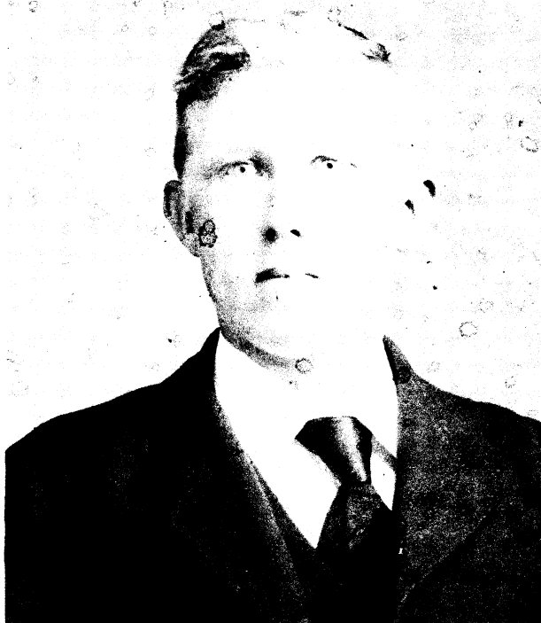
What is this?