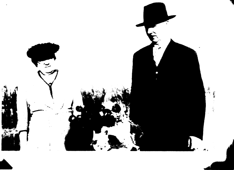
March 22nd, 1931 Silver Anniversary