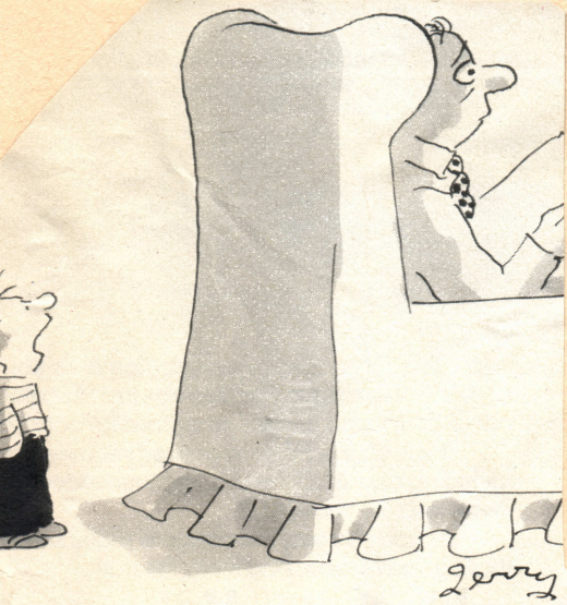
"Can you lend me a hundred bucks, without asking me a lot of personal questions?"