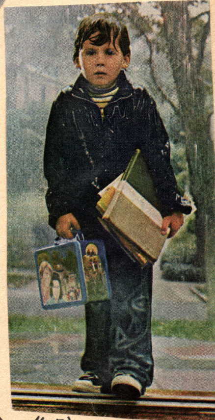
"I'M NOT GOING TO SCHOOL ANYMORE"