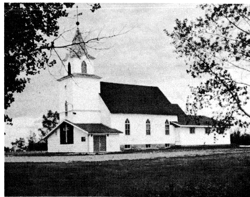
Bethlehem Lutheran Church — 1984